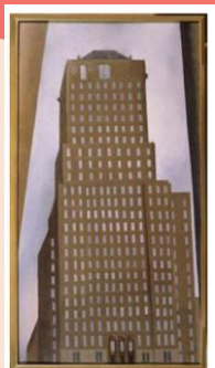
Shelton Hotel New York No. 1 Georgia O'Keeffe • 1926