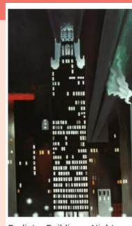
Radiator Building - Night, New York Georgia O'Keeffe • 1927